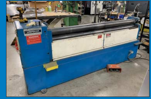
10 Ga. X 6' American Model SRD6130 Plate Rolls