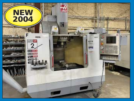
Haas Model VF-2SS CNC Vertical Machining Center