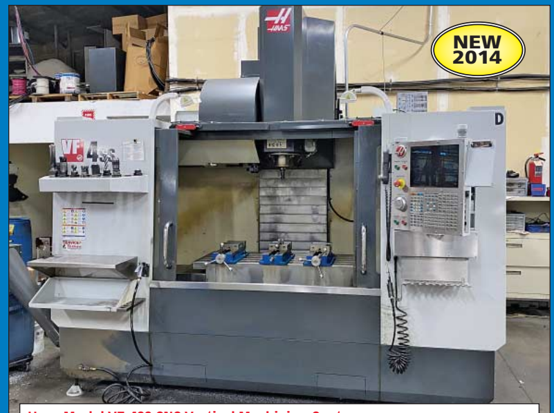
Haas Model VF-4SS CNC Vertical Machining Center

INSPECTION: Day Prior from 10AM to 4PM or by appointment with joe@cia-auction.com