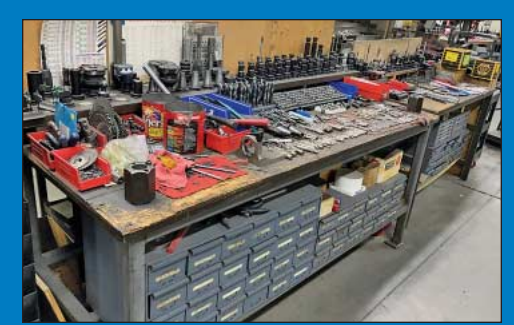
(200) 40 Taper Tool Holdes and Perishable Tooling