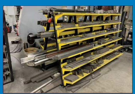
Various Press Brake Dies