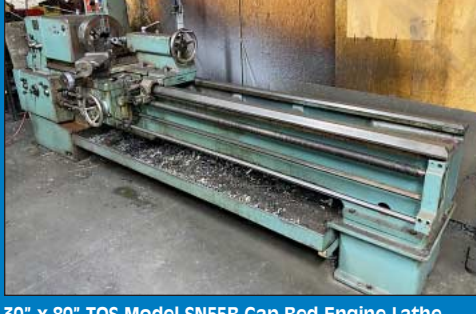
30" x 80" TOS Model SN55B Gap Bed Engine Lathe \mbox{w/DRO}