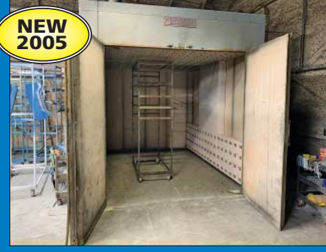
8' Wide X 12' Deep X 8' High Wisconsin Model EWN-812-8G Natural Gas Batch Oven