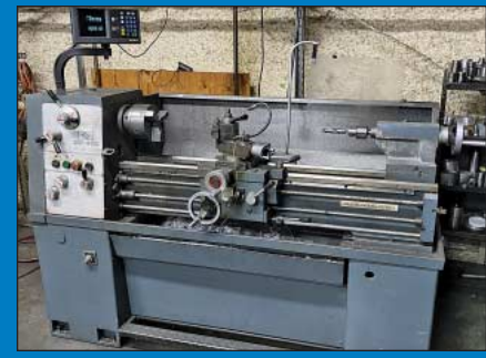
14" X 40" KBC Model GRIP-1440G Gap Bed Engine Lathe