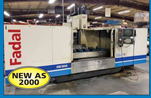
(2) Fadal Model VMC-8030HT CNC Vertical Machining Center