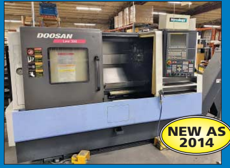
(2) Doosan Model Lynx 300 CNC Turning Centers