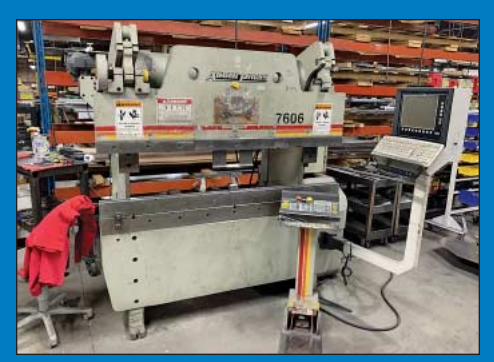
60 Ton X 6' Accurpress Model 7606 Hydraulic Press