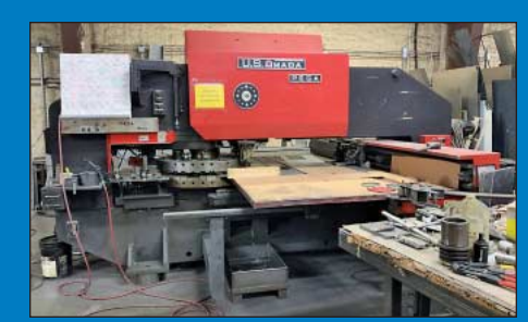
30 Ton Amada Model PEGA-305072 CNC Turret

Office Equipment Including; Desks, File Cabinets, Lateral File Cabinets, Chairs, Breakroom Furniture, Refrigerators & More