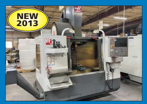
Haas Model VF-2SS CNC Vertical Machining Center